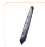
AP20 Interactive Pen