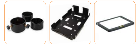
Microscope Adapter Security Bracket Light Box