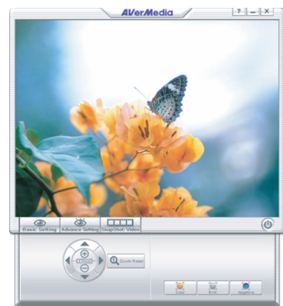
Image capture and USB camera capabilities