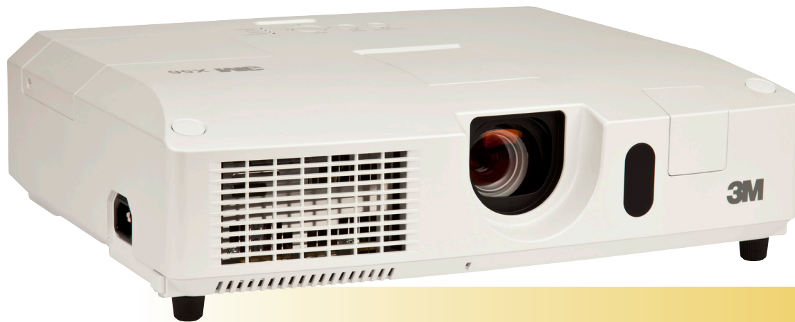
3M Digital Projector X56 78-9236-7730-2

With 5,000 lumens of brightness, extensive connectivity, horizontal/vertical lens shift and a x1.7 zoom lens, the 3M Digital Projector X56 is designed for even the most challenging installations. Stack two X56 projectors and get an incredible 10,000 lumens for ultra bright images. Network control and presenting facilities makes maintenance and broadcasting messages super easy. Up to 5,000 hours lamp life gives you low cost of ownership.