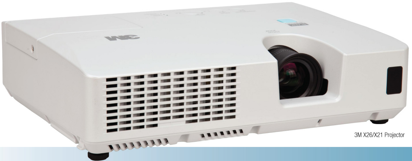
3M X26/X21 Projector

In the classroom the X26/X21 model offers White, Green and Blackboard modes. With built-in image templates the user can also project useful guides onto the screen for assisting annotation. Other cost-saving features that make the X26/X21 not only the ideal education projector but also a highly efficient business tool include Hybrid filters for 5,000 hour maintenance intervals; less than 1 watt stand-by power consumption; and 'Auto-eco' Mode for cost efficiency management.